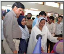
page 6 INSPYRE and iACT Students Exhibit their Work