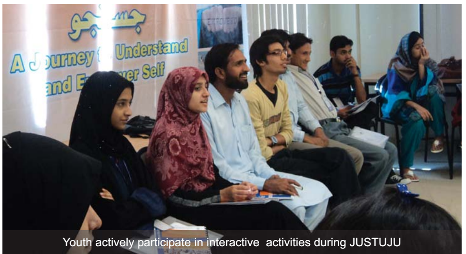
Youth actively participate in interactive activities during JUSTUJU

First JUSTUJU workshop was held from October 25 – 30, 2011 at the Institute for Advancing Careers and Talents (iACT). The workshop welcomed 32 young participants with a perfect gender balance. The 3 building blocks of empowerment namely, self awareness and confidence, emotional intelligence, and critical thinking and decision making were profusely discussed during the workshop through enthralling activities, presentations, group discussions, case