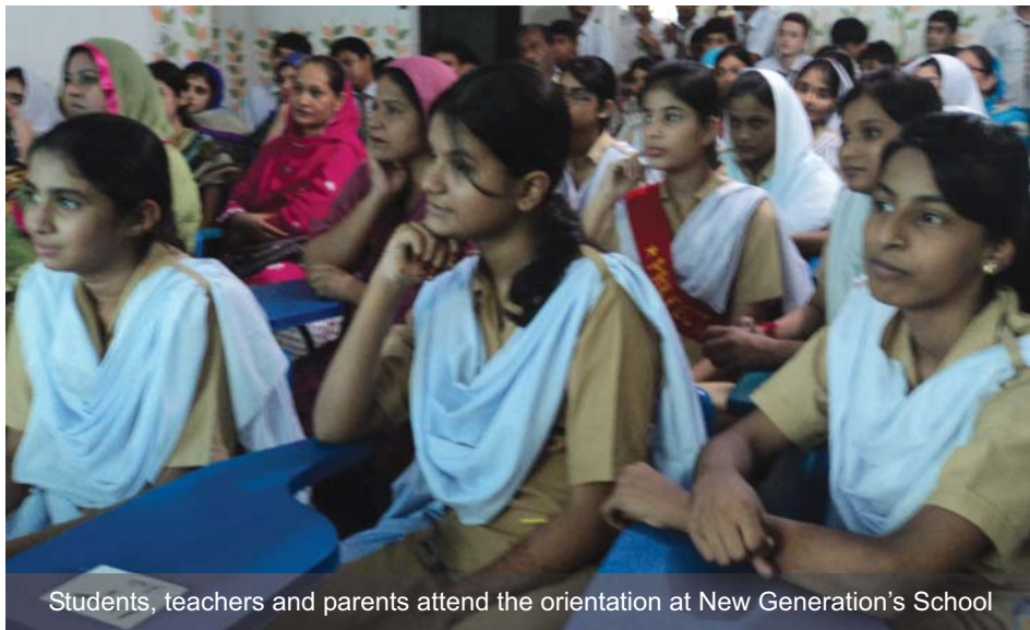
Students, teachers and parents attend the orientation at New Generation's School

Meetings, discussions and sharing of iLEAD material with the management of potential partner institutes generated enough curiosity and enthusiasm among teachers and principals of partner schools for them to ask