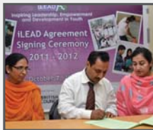
page 7 iLEAD Agreement Signing Ceremony