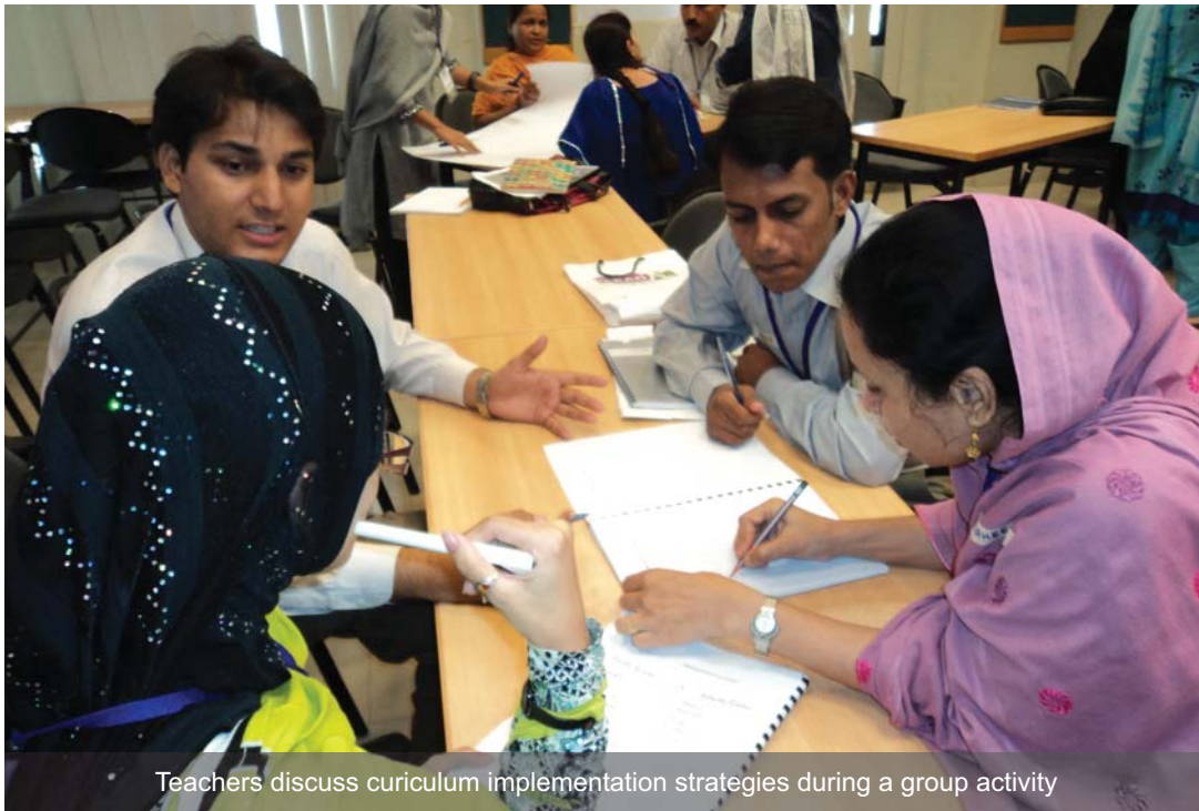
Teachers discuss curriculum implementation strategies during a group activity

The training was held from October 17-22, at the Institute for Advancing Careers and Talents, Malir. The program engaged teachers in a variety of interactive activities in order to develop an understanding for curriculum implementation.