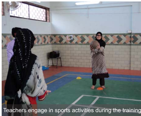
Teachers engage in sports activities during the training