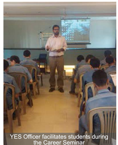
YES Officer facilitates students during the Career Seminar