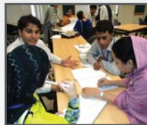
page 8 Inspiring and Engaging the Teachers of iLEAD Partner Institutes