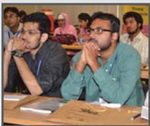
page 2 Exploring and Building Partnerships