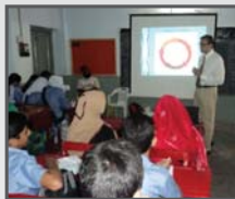
page 4 YES Career Seminars