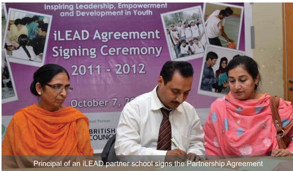
Principal of an iLEAD partner school signs the Partnership Agreement

iLEAD Agreement Signing Ceremony with its partner for 2011-12 was held on October 7, 2011 at Institute for Advancing Careers and Talents (iACT). The ceremony gathered principals, officials and teachers of 6, iLEAD partner schools who have decided to join iLEAD in implementing the Nurturing Healthy Minds and Bodies (NHMB) curriculum namely, New Generation's School, Hyderabad Higher Secondary School of Academic Excellence, Government City