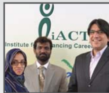
page 5 Young Learners Graduate: Graduation Ceremony Held at iACT