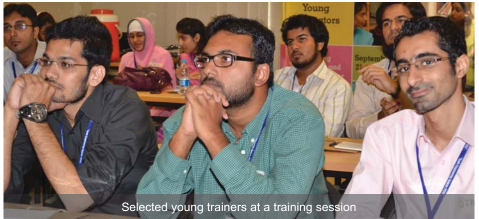
Selected young trainers at a training session

YES has designed an innovative program to facilitate youth to understand the notion of empowerment and acquire pertinent knowledge and skills. The program has been launched under the title of 'JUSTUJU' and is being implemented by youth for youth.